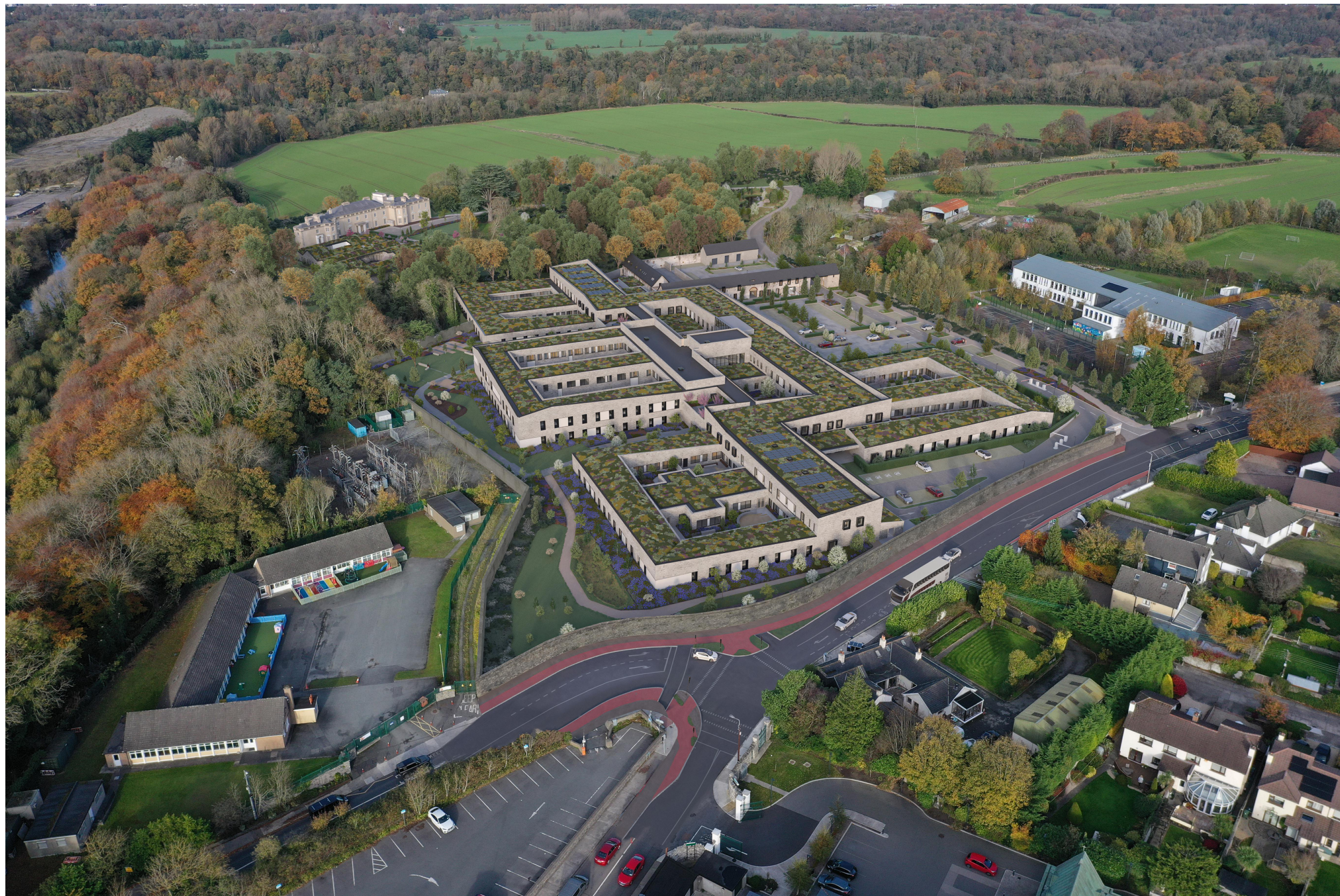
Aerial View of the Proposed Development with Indicative Chapel Hill Junction Improvement

COPYRIGHT: The design and details shown on this drawing are applicable to The Named Project only and may not be; reproduced, modified or relayed in whole or part or be used for any other project or purpose without the prior written permission of TOT Architects with whom copyright resides. DO NOT SCALE this drawing. Use figured dimensions only. The Contractor is responsible for checking all levels and dimensions on site prior to commencement of works. Any discrepancies are to be referred to the ARCHITECT. Drawings to be read in conjunction with all other Consultants Drawings & Specifications were relevant. Proprietary items shall be fixed in strict accordance with the Manufacturer's Instructions. Sizes of proprietary items shall be checked with Manufacturer.